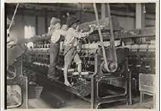
Often, children were used as workers in factories.